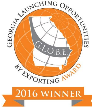
Globe Award Logo