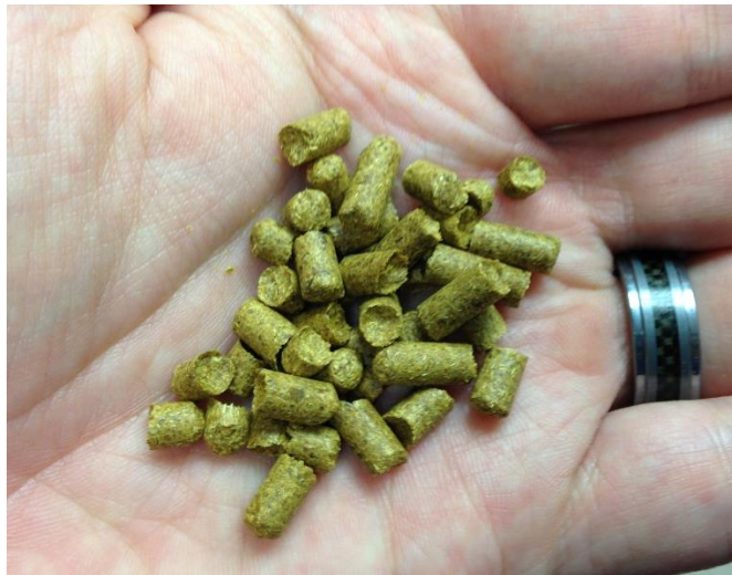
Typical SPR for hops and hop pellets frequently used for brewing.

8 Redmond Court, Rome, Georgia 30165 · 706-234-4111 info-hdi@hydrodynamics.com · www.hydrodynamics.com